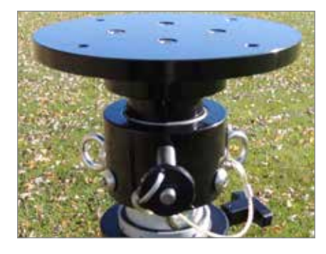
Interchangeable Payload Adaptors Stub and Stub Plate Shown