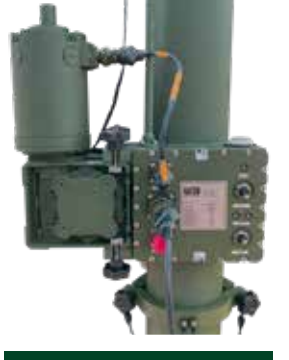
Automatic Electric Motor