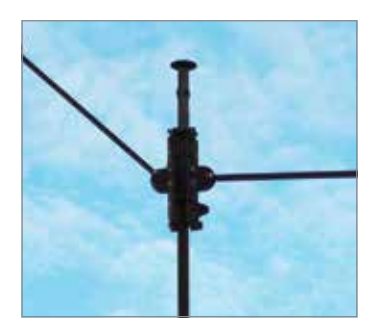
AM2 with EZ Raze Payload Elevation System Easily elevate and lower multiple antennas and sensors