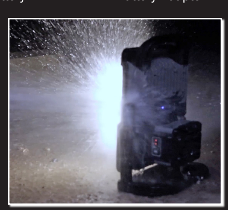
Rugged and tough design with IP65 rated enclosure