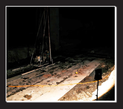
Designed for harsh environments with ultra-wide 330 ft / 100m beam