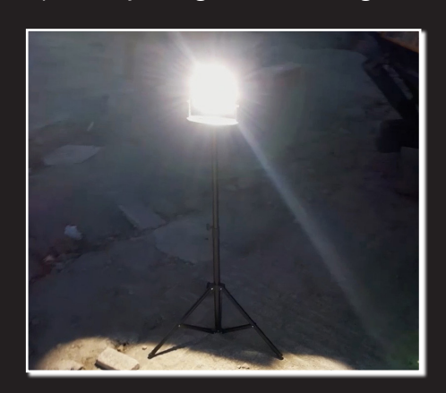
Up to 7.5 hour runtime and 2 hour charging time