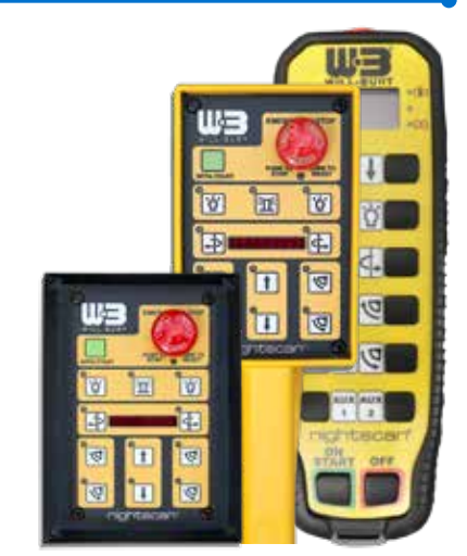
Powerlite, Xtreme and Vertical Panel Mount Control

Chief and Vertical Complete Panel Mount Control