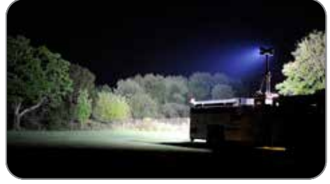
Provides over 384 sq. meters of safe work area at 30+ lux