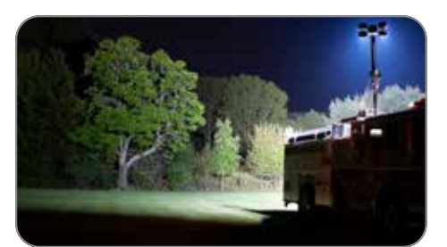
Extends 2 meters above the emergency service vehicle