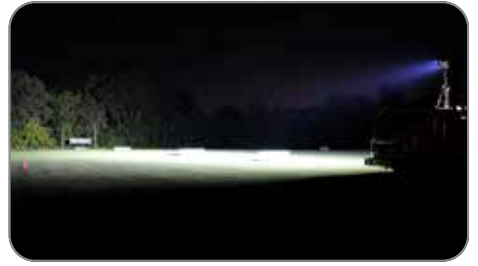
Dual optics for near and far illumination