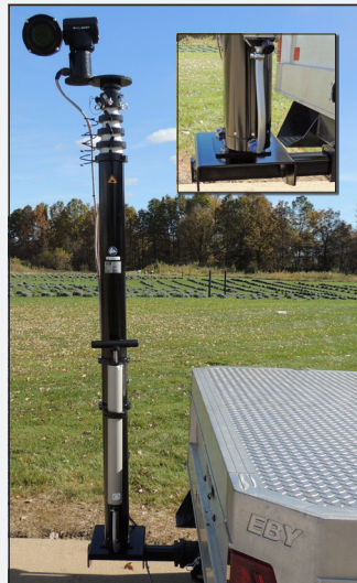
2" Hitch Mount