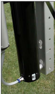
Quick Connect Mast Locked