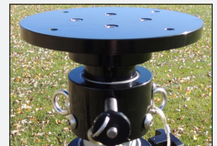
Interchangeable Payload Adaptors Stub and Stub Plate Shown