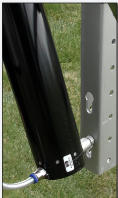
Quick Mast Connect Unlocked