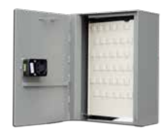
KC-1612 (Holds 180 Keys)