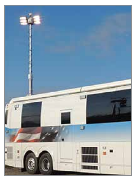
Night Scan® Command Center Application