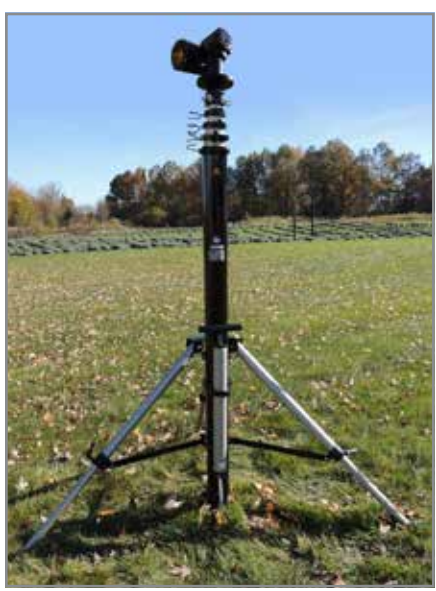
Hurry Up Portable, Pump Up Mast