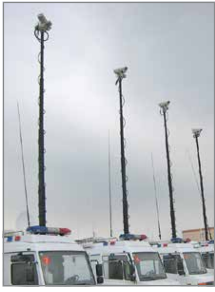
GEROH KVL Robust, Crank Mast