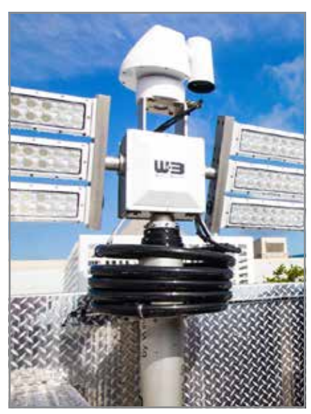
Night Scan® Light Tower with Camera