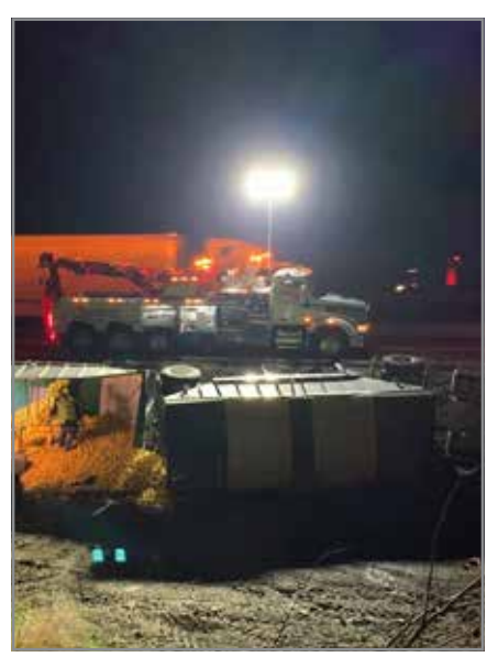
Night Scan® HDT Heavy-Duty Towing Light Tower