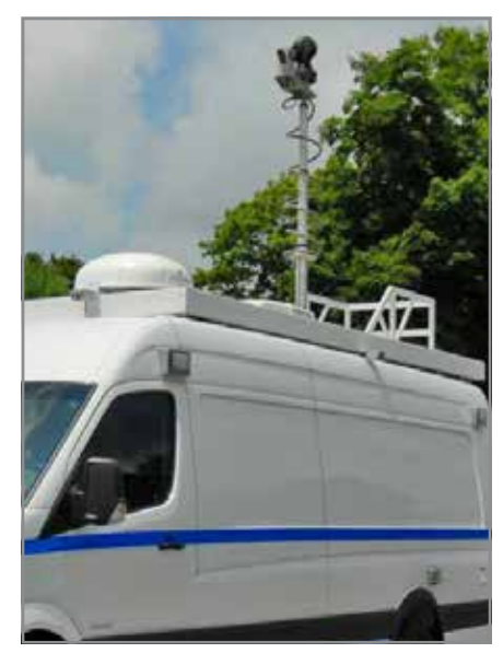
Inflexion™ Roof-Mount, Fold-Down Mast

Will-Burt's video systems have been designed for integration into the wide variety of elevation and light tower solutions. Video solutions have been specifically designed for many industries such as Fire and First Responders, Broadcast, Security, Police, Towing, Oil and Gas, Mining and Construction. Will-Burt can also design custom packages to meet your unique requirements.