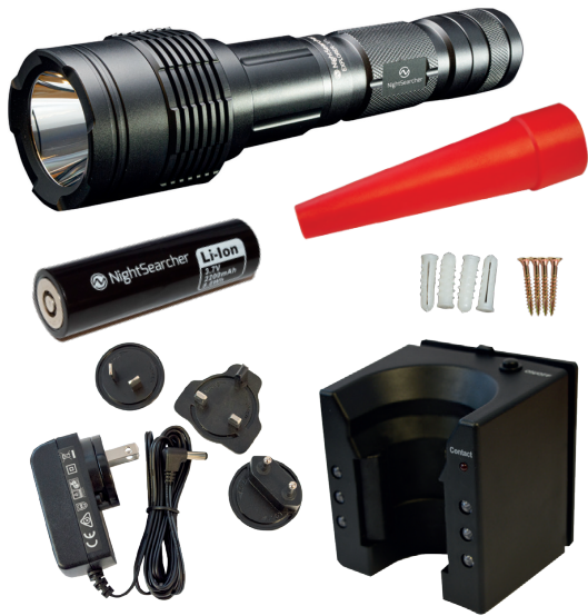
Supplied with Lithium battery, Charging station with fixings, red cone and an AC mains charger with 4 country plug adaptors.