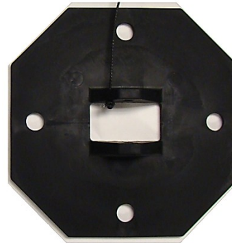
Figure 2: New Style “O” Pattern