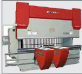
CNC Press Brakes