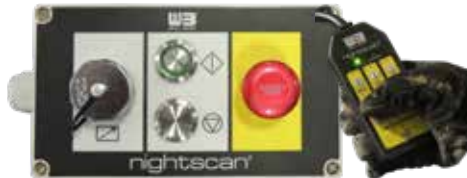
The wired controller allows for full 360° pan & tilt remote light positioning