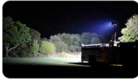
Provides over 384 sq. meters of safe work area at 30+ lux