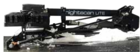
Tested and proven to be reliable in extreme environments