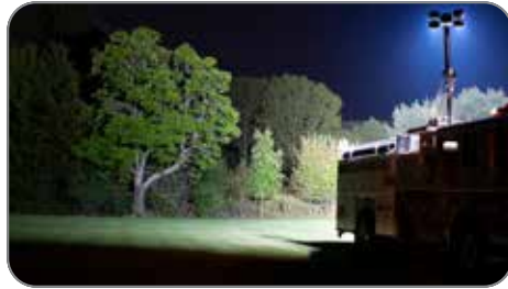
Extends 2 meters above the emergency service vehicle