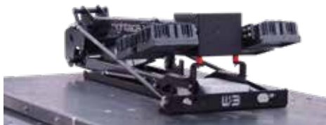
Can be installed on nearly any flat vehicle or trailer surface