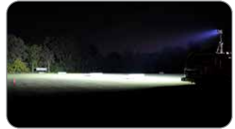
Dual optics for near and far illumination