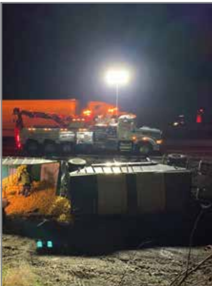
Night Scan® HDT Heavy-Duty Towing Light Tower