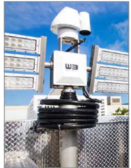
Night Scan® Light Tower with Camera