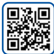
Visit Corporate Website