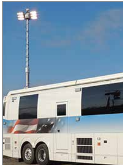
Night Scan® Command Center Application